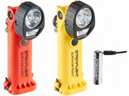
Pictured with magnet option

Material/Lens: Housing, base, and battery housing made from high-impact, super tough polymer offering exceptional durability. Spring-loaded clip with built-in D-ring easily attaches to belts and harnesses and reduces unwanted rotation. One-way valve for case venting. Available in orange and high-visibility yellow.