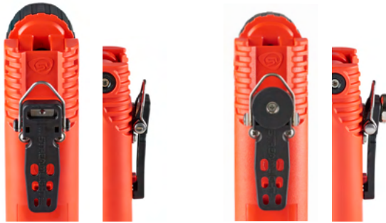
Pictured without magnet option